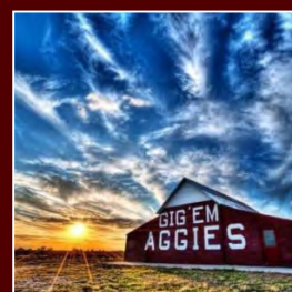
$1,000 GIG 'EM LEVEL

Please help Foster the Spirit by enclosing your Tax Deductible 2022 Spirit Sponsorship using the form on the back of this newsletter or pay online at highlandlakesaggies.com .