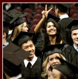
$500 TRADITIONS LEVEL