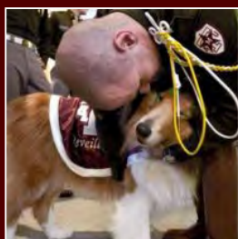
$2,500 REVEILLE LEVEL

Please help Foster the Spirit by enclosing your Tax Deductible 2022 Spirit Sponsorship using the form on the back of this newsletter or pay online at highlandlakesaggies.com .