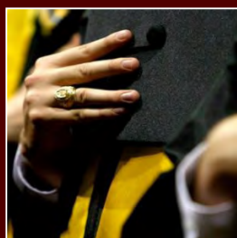
$100 SPIRIT LEVEL